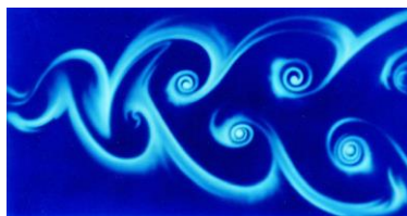
Kármán vortex street