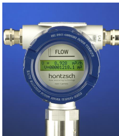
Ex-d transducer housing with optional LCD display